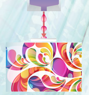
No waveform control