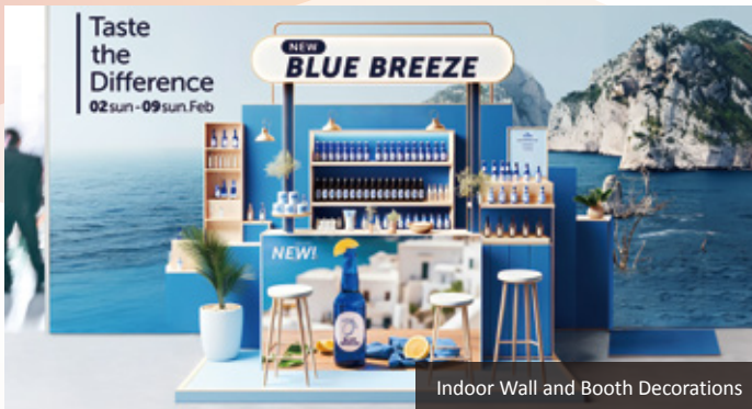
Indoor Wall and Booth Decorations