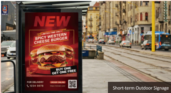
Short-term Outdoor Signage