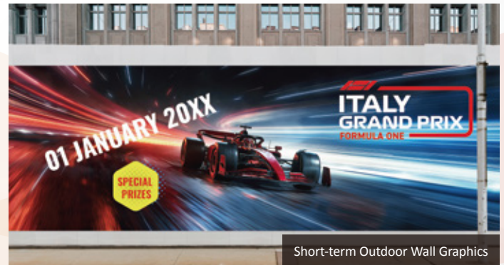
Short-term Outdoor Wall Graphics

*Media printed with water-based pigment inks has limited water resistance.